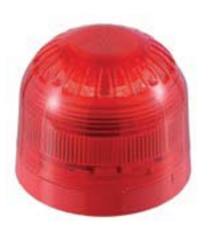
Applications - Fire; security; industrial alarm